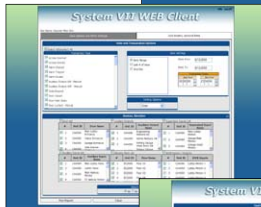
Web Report Screen