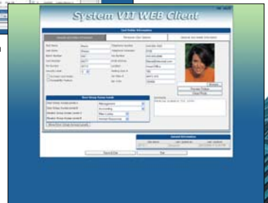
Card Holder Edit Screen